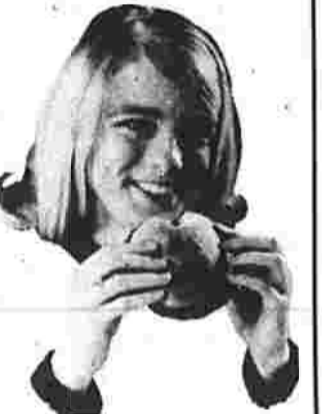
TENDERGURE CORNED BEEF...

BLOCK ISLAND FRESH SWORDFISH lb. 99c DAILY SHIPMENTS TUESDAY THROUGH FRIDAY. BONELESS CHUCK FAMILY STEAK lb. 99c. U.S. CHOICE CHUCK (BONE IN) STEAK OR CENTER ROAST lb. 79c.